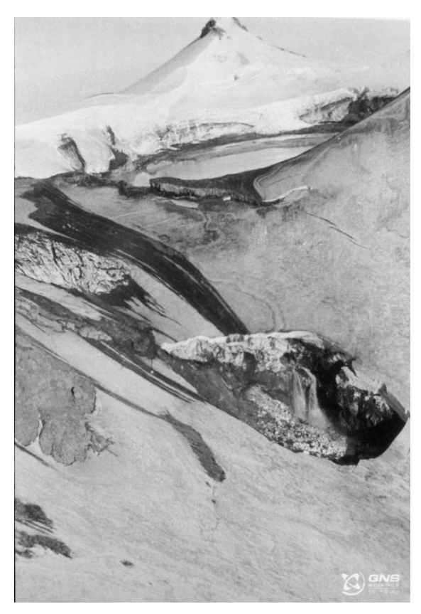
Photo 6 – Mount Ruapehu Crater Lake Outlet after the Tangiwai Disaster on December 28, 1953

The lahar is believed to have reached the Tangiwai bridge sometime between 10:10pm and 10:15 pm [26]. It took the wave 2 hours and 15 minutes to travel the 38 km to the Tangiwai bridge at an estimated average flow velocity of 4.7 m/s (16.9 km/hr). The lahar density was calculated by Mr. James Healy to be 1600 kg/m<sup>3</sup> [14]. The lahar at the Tangiwai bridge was a mixture of water, ice, mud, sand, and boulders, some as large as 1.2 m in diameter [26]. The Crater Lake water level dropped 7.9 m, with 6 m of the drop occurring in the first 150 minutes. The flow varied from a maximum peak of 850 m<sup>3</sup>/s to 36.7 m<sup>3</sup>/s. The last 1.8 m discharged relatively slower [26].