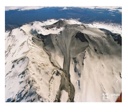
Photo 1 – Mount Ruapehu lahar, following eruption 24 September 1995