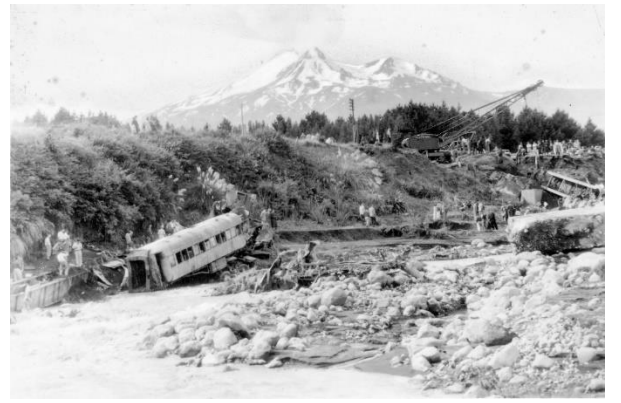
Photo 9 - The scene at the site, looking toward the west -Dec 25, 1953, Mount Ruapehu in the background

"What greeted us I will never forget: first, a strange silence – an aerie atmosphere – which hung over and around the disaster scene. Before our eyes was unbelievable destruction, as if a giant Gulliver had flung this mighty railway train of steel into the river. The concrete and steel bridge had been smashed beyond comprehension. Wrecked carriages were scattered unbelievably in all directions. Seats, blankets, suitcases, children's toys, some still wrapped in festive paper, and many personal belongings, all lay half buried in silt and mud wherever one stepped."