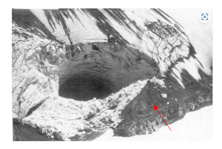
Photo 8 – Ruapehu Crater Lake outlet after the Tangiwai disaster on Dec 28, 1953 – the red arrow indicates the breached 1945 lava and tephra/debris layers