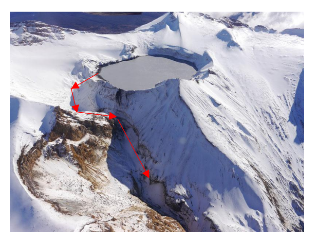
Photo 5 – Mount Ruapehu Crater Lake – the red arrow indicates the Whangaehu River

The Crater Lake undergoes thermal cycles with the water temperature fluctuating between approximately 15°C and 40°C in a period of 6-12 months; it is usually lukewarm, but during eruptions it may reach boiling point. Historical records indicate that the lake was observed boiling in 1886. On rare occasions, the lake freezes, as reported in 1886 and 1926 [19].