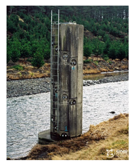
Photo 10 - Rail lahar warning system, Whangaehu River, Taupo Volcanic Zone