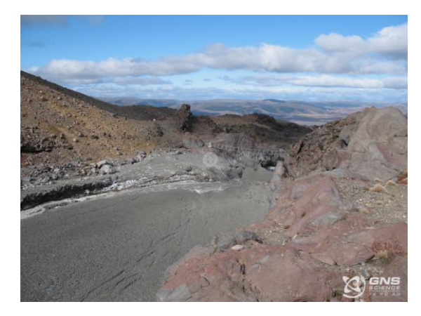
Photo 2 – Lahar deposits in Whangaehu Valley, Ruapehu, following Ruapehu eruption on the night of Tuesday 25 September 2007