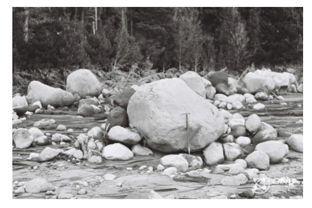
Photo 3 - Whangaehu River boulders on April 28, 1975