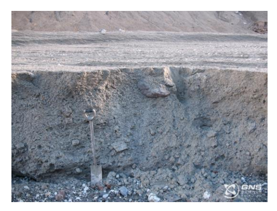
Photo 4- Lahar deposits in Whangaehu Valley, Ruapehu on September 26, 2007, by Vern Manville (Copyright GNS Science / EQC)