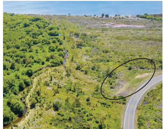
The Waimarino River site Jan 2017, Waiotaka Planting, willows on the true left, restoration on the right. Our latest planting area is circled, watch this space as you drive by.

Tongariro High School Academy students did a great job helping with planting at several of our Waiotaka sites, as did the Hirangi Kura students. We hope to have an ongoing relationship with these schools. Our five sites at Waiotaka and Stump Bay require ongoing maintenance and infill planting, so we will be asking for your help again.